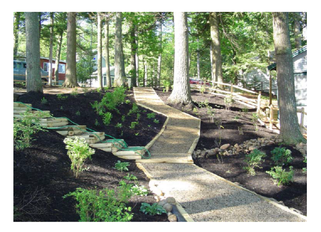
Photo from a Forest Lake property addressed in the early 2000s. Improvement practices installed included infiltration steps, defined walking path, native plants, and erosion control mulch.

Grant funds are available through the Forest Lake Protection Project, Phase III which was funded in part by the U.S. Environmental Protection Agency under Section 319 of the Clean Water Act and administered by the Maine Department of Environmental Protection. The FLA is an active partner with the District to address the highest water quality impact sites identified in the 2017 watershed survey and to strengthen ongoing lake stewardship efforts.