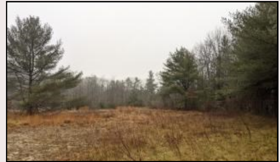
An image of the former McKin site.

You can read more about this development on our website . Our website also contains points of contact should you have any questions.