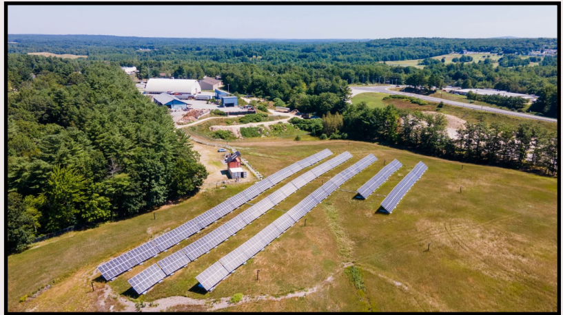
The solar array near the Transfer Station on Seagull Drive in Gray.

When the sun is shining, the solar array produces electricity that is either used in real-time by Town buildings, or fed back to the electricity grid where it benefits our community (and earns the Town a credit). Each year, the system will offset about 475,995 pounds of carbon, the equivalent of over 607,446 miles driven in a gas-powered car.