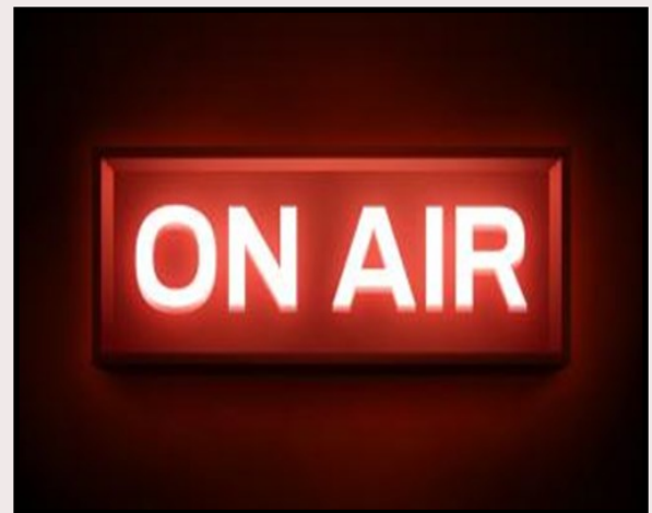
Community Media Night aims to educate Gray residents about GCTV.

Please visit our website to learn more about this event .