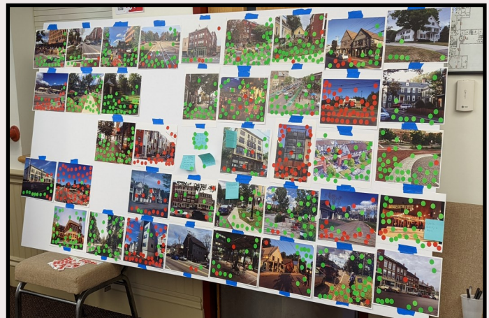
Gray residents expressed plenty of ideas during the Gray Village visioning week!

We hope you also enjoyed the block party on July 29. It was a great chance for residents to come out and enjoy local food, live music, and continue the valuable visioning work. We want to hear your feedback about the visioning process and the block party. Please take a few minutes to complete this survey . The results of this survey will, in part, allow us to plan similar events in the future.