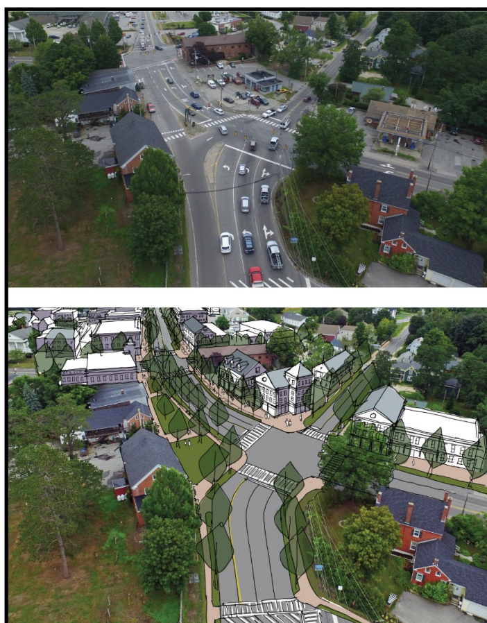
From the Principle Group's report: a potential new look for the Village that makes it more people-friendly.

For landowners and business owners, this work deeply considers how the project will impact business. Where in the plan you may see existing parking lots replaced by buildings, parking shifts to the street. Street parking is one of Gray's untapped assets. With slower, safer and more inviting streets outside the doors of businesses and residences, more people will want to be in Gray Village. A 30-second delay might force drivers (particularly trucks) to seek alternatives. The tradeoff: the people of Gray get to have beautiful, safe streets, outdoor cafes and restaurants and thriving shop fronts. Gray, in a short few years, could become a destination, a 1 - 2 hour resting stop before continuing to the mountains or lakes, and an even better place to live." Read the full report, and other material related to the Gray Village project, on our website .