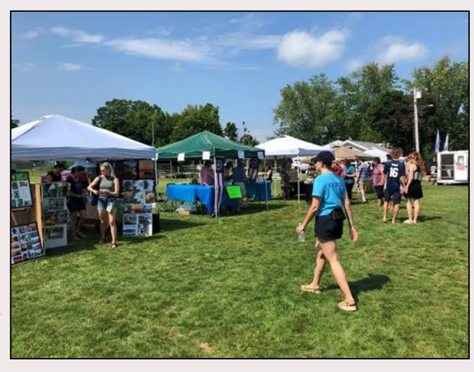
The Blueberry Festival spotlights local products and celebrates the diverse uses of Maine's blueberries.

To stay posted on updates about the festival, follow the event on Facebook.