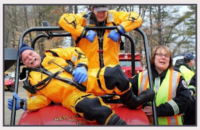
Volunteers form the backbone of our community!

The Gray Town Council encourages and welcomes