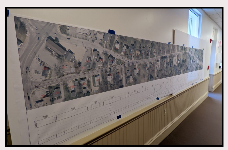
This display in the Town Office captures the project's extent.

If you have any questions about this project, the Community Development Office is happy to meet one-on-one with you and address your input about the proposed changes. You can call them at 207-657-3339. You can also find in the Town Office a display that captures the extent of the planned work, as pictured to the right.