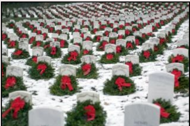
Wreath Day will honor our town's fallen heroes.

On December 17, 2022 at 12:00 p.m., American Legion Post 86 (ME0103) will help Gray Village Cemetery remember and honor our veterans by laying remembrance wreaths on the graves of our country's fallen heroes. Please help honor and remember as many fallen heroes as possible by sponsoring remembrance wreaths, volunteering on Wreaths Day, or inviting your family and friends to attend with you.