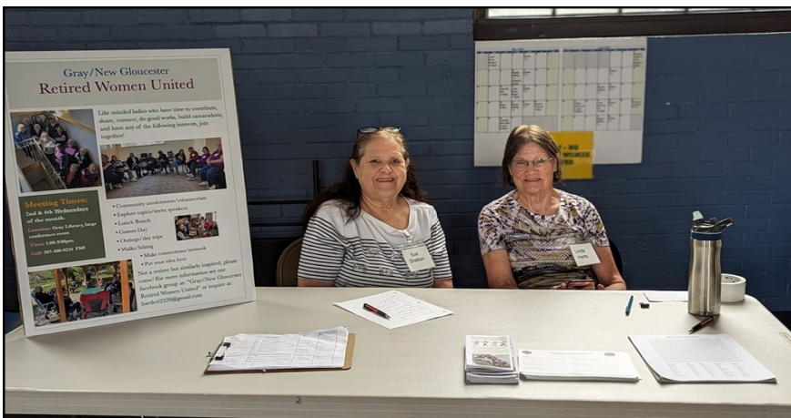
The Gray/New Gloucester Retired Women United, just one group that was represented at the first-ever Gray Community Day in June.

June – The Town of Gray relaunched its YouTube channel , which now provides accessible content about Town business and community events. The channel is a home for meeting recordings of the Town Council, Zoning Board of Appeals, Planning Board, select School Board meetings, Gray Community Television content, and public forums.