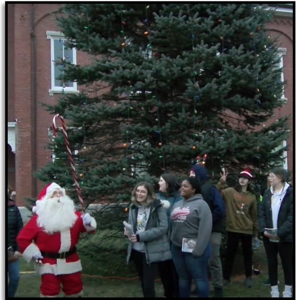
Santa was on hand to light Gray's holiday tree. This community tradition is growing every year!

Thank you to all community members, volunteers, businesses, Town staff, and friends of Gray who contribute every year to making Gray a great a place to live, work, and play. Here's to a great 2024!