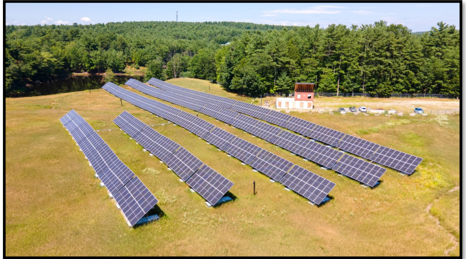
The solar array near the Transfer Station on Seagull Drive is an example of Gray's push for resiliency.

For the second December in a row, a bugaboo of a windstorm hit, this one paired with some rather intense flooding. Events like these make us all more conscious of practical concerns impacting ourselves and our neighbors. And as we prepare for the next storm, it seems like a good time to give an update on the Resiliency Committee.