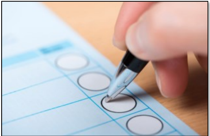
Attendees will, among other things, elect municipal party leaders.

The Republican Party caucus will be from 10 a.m. to 12 p.m., and the Democratic Party caucus will be from 1 p.m. to 3 p.m.