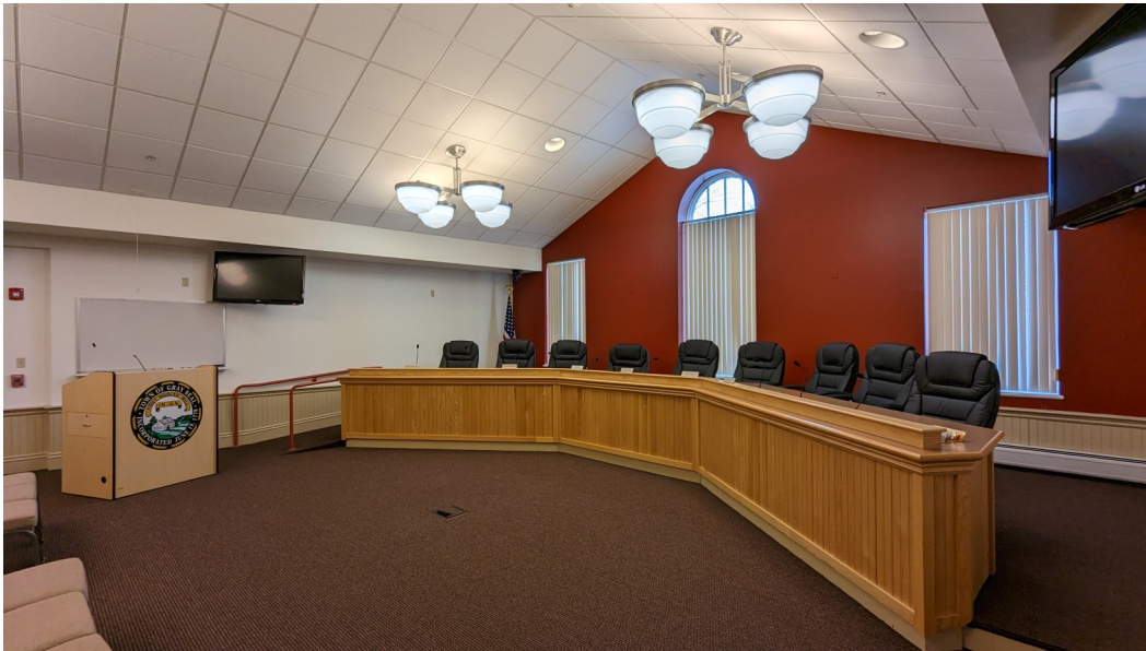
The Council Chambers will host public feedback on the FY25 budget.

Town of Gray municipal leadership is preparing our Fiscal Year 2025 budget, which runs from July 1, 2024, to June 30, 2025. One of the most important aspects in crafting this year's budget is your input .