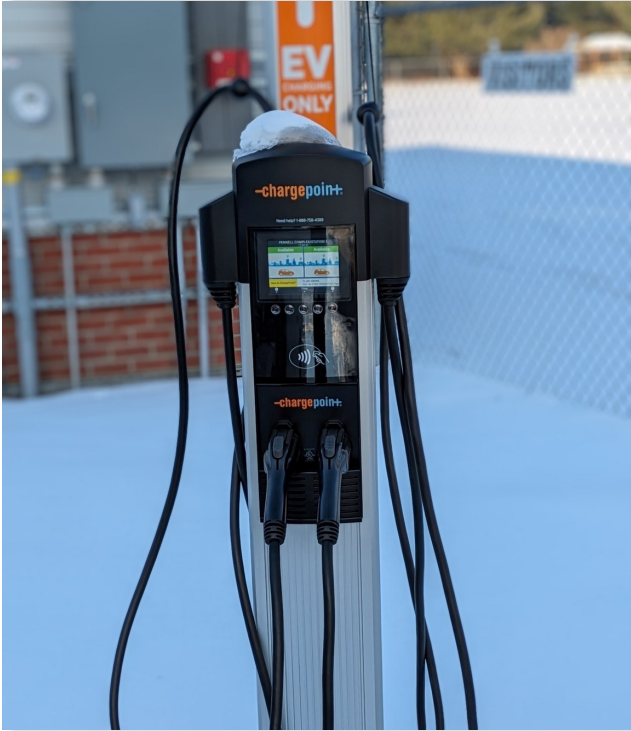
One of the new EV chargers at 24 Main Street.

Are you an electric vehicle owner in Gray looking for a convenient and reliable charging spot? Look no further! The Henry Pennell Municipal Complex is now equipped with two cutting-edge EV chargers, marking a significant milestone as the town's first public commercial-grade charging stations. These chargers can accommodate two electric vehicles simultaneously. The cost is $0.20 per kilowatt and $2 per session.