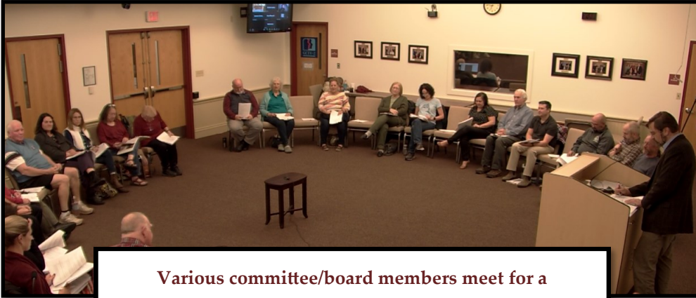
Various committee/board members meet for a Leadership Academy in 2022.

Serve your town by volunteering for these committees!