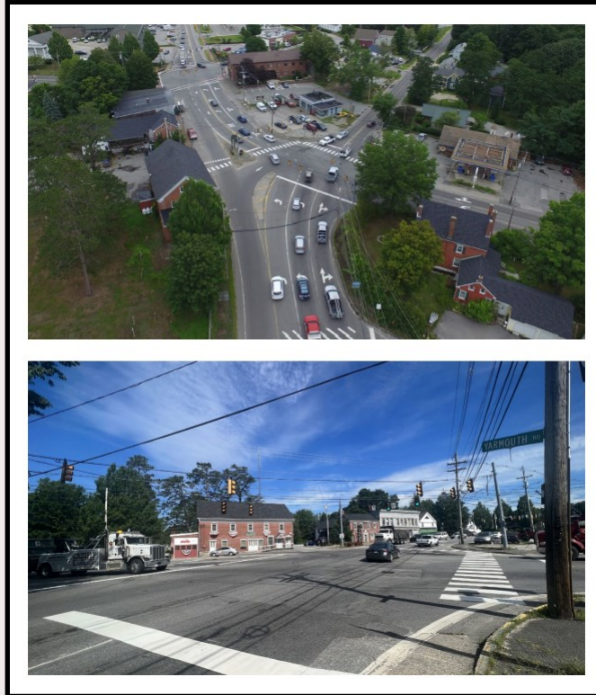
The Principle Group's report focuses on how Gray can change its Village to make it more people-friendly.

If you have questions about this report, please email the Town of Gray .