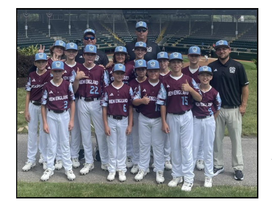
The G-NG/R team

For the first time since 2005, a Maine Little League team has played in the Little League World Series. The Gray-New Gloucester/Raymond team played two games before being knocked out—the first against Seattle on August 17, and then Media, Pennsylvania on August 19.