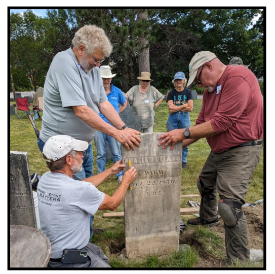
Numerous gravestones received clean-up

Any Gray resident with an interest in the Gray Village Cemetery and the Gray Cemetery Association's mission is encouraged to learn more at <u>gca-maine.org/board</u> or by contacting <u>gray.maine.cemeteries@gmail.com</u>.